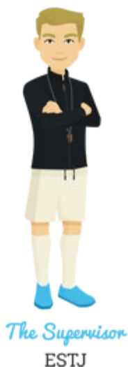
The Supervisor ESTJ

ESTJs are organized, honest, dedicated, dignified, traditional, and are great believers of doing what they believe is right and socially acceptable. Though the paths towards “good” and “right” are difficult, they are glad to take their place as the leaders of the pack. They are the epitome of good citizenry. People look to ESTJs for guidance and counsel, and ESTJs are always happy that they are approached for help.