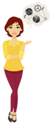
The Thinker INTP

a keen eye for picking up on discrepancies, and a good ability to read people, making it a bad idea to lie to an INTP. People of this personality type aren't interested in practical, day-to-day activities and maintenance, but when they find an environment where their creative genius and