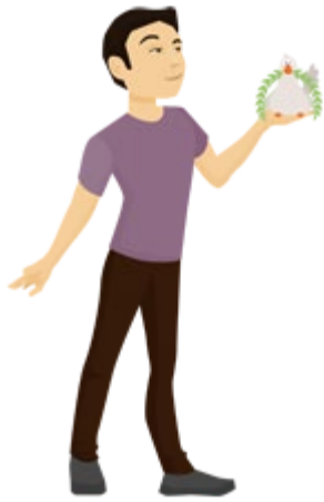
The Idealist INFP