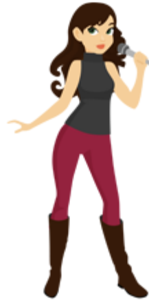
The Performer ESFP

people” with strong interpersonal skills. They are lively and fun, and enjoy being the center of attention. They are warm, generous, and friendly, sympathetic and concerned for other people’s well-being.