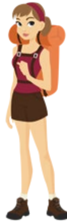
The Doer ESTP

ESTPs have an Extraverted, Sensing, Thinking, and Perceptive personality. ESTPs are governed by the need for social interaction, feelings and emotions, logical processes and reasoning, along with a need for freedom. Theory and abstracts don't keep ESTP's interested for long. ESTPs leap before they look, fixing their mistakes as they go, rather than sitting idle or preparing contingency plans.