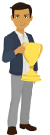
The Champion ENFP