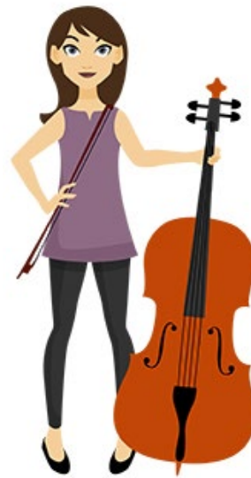
The Composer ISFP

friend to tag along in whatever activity, regardless if planned or unplanned. ISFPs want to live their life to the fullest and embrace the present, so they make sure they are always out to explore new things and discover new experiences. It is in experience that they find wisdom, so they do see more value in meeting new people than other introverts.